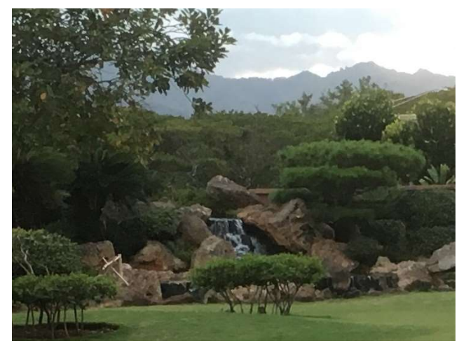
Garden at HUOA 2019